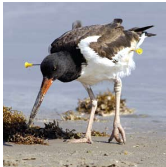
Juvenile American Oystercatcher Haematopus palliatus carrying two blow-darts near Port Aransas, Texas, October 2008.