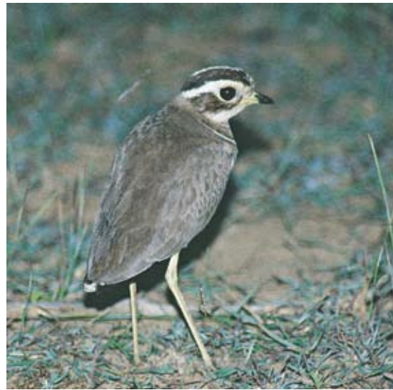
Jerdon's Courser

In another recent announcement, the Ontario government pledged to permanently protect 225,000 km 2 of boreal forest in the northern area of the province. Covering more than 20% of Ontario's total land mass, the area to be protected is roughly the same size as the UK. Scientists around the world