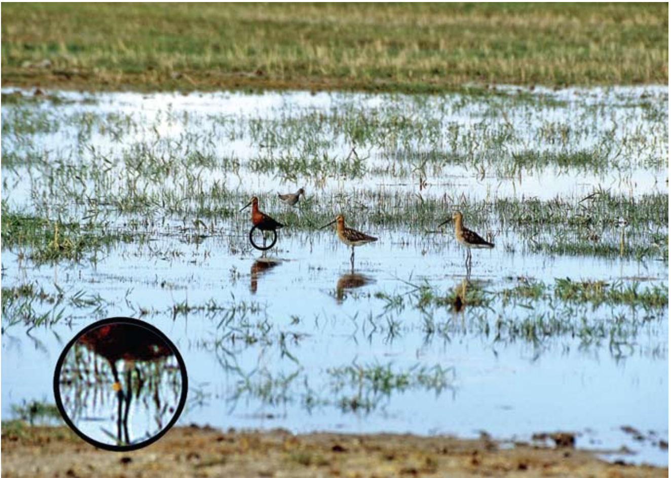
Fig. 1. Male Asian Dowitcher with yellow leg flag from NW Australia together with two females close to a nest, Airag nuur, Mongolia, June 2006.