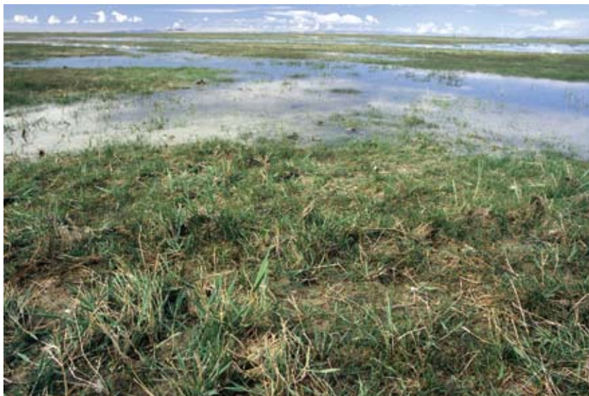
Fig. 2. Asian Dowitcher nest with four eggs (centre foreground) at Airag nuur, Mongolia, June 2006.

on the left leg. The metal ring could not be read in the field. It was subsequently established that the bird would have been ringed sometime between 1992 and 2006 in NW Australia, either at Broome, Eighty Mile Beach or Port Hedland Saltworks. In total, 107 Asian Dowitchers have been marked with a combination of a yellow flag and a metal ring at these sites over this period (C.D.T. Minton, pers. comm.). The ringing