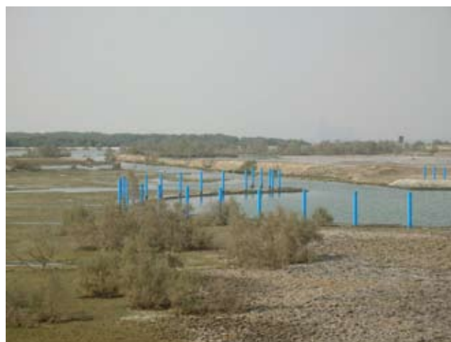
Fig. 2. Khor Dubai, showing engineering and mangrove planting that has reduced its attraction to waders